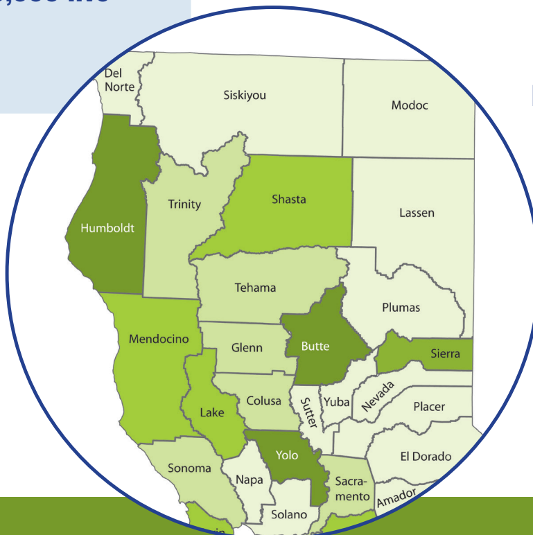
Northern California Poverty Rate by County

This poverty map, adapted from one created by the Public Policy Institute of California and Stanford Center on Poverty , depicts the high percentage of people in Northern California living below the poverty line.