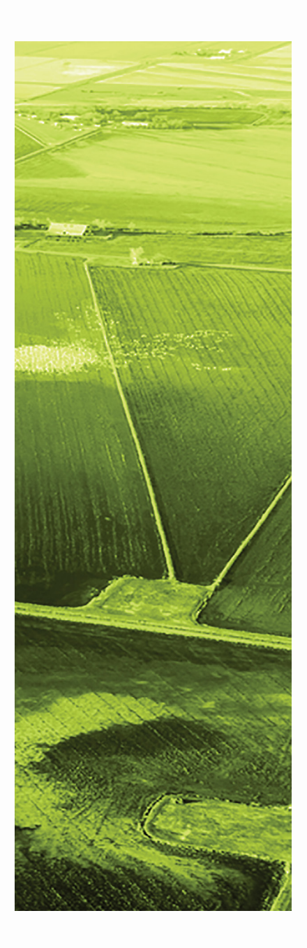
Adapting to our climate reality by strengthening California's rivers, landscapes, communities and farms.